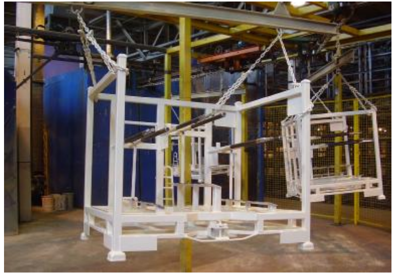
Our standard paint process includes a phosphate wash and curing oven, which are integrated into a streamlined, high-volume system

ADS understands the disastrous implications of late deliveries and poor quality product. The challenge is to address these issues in a cost effective manner. ADS rises to this challenge by maintaining a flexible manufacturing environment in our 350,000 s/ft facility that allows an extensive amount of production to be completed in a remarkable amount of time while still maintaining an acceptable cost base. ADS's dedication to quality is demonstrated by their ISO 9001:2008 certification. We welcome the opportunity to show you what we can do, and believe your experience will give you the confidence to rely on ADS.